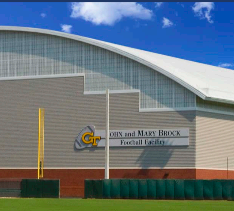
Georgia Tech Indoor Football Facility, Atlanta, GA